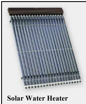
Solar Water Heater

By identifying the sources of energy being consumed, we can then calculate potential energy savings and costs associated to achieve the identified savings opportunities.